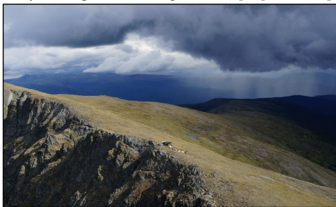
DIAMOND DRILLING AT THE QUEEN SHOWING

The Queen Showing was discovered in 2016 near a ridge top and has been traced for 25 m along strike before being covered by talus. A continuous chip sample from the Queen Showing returned 462 g/t gold, 79.6 g/t silver, 1.02% lead and 0.28% copper over 0.40 m.