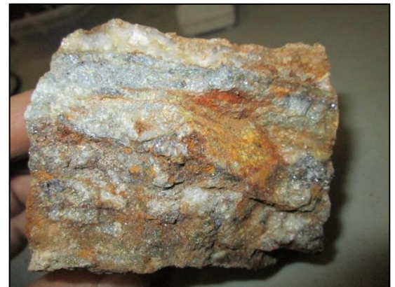
HAND SAMPLE FROM THE DISCOVERY OUTCROP

In 2017, prospecting identified new mineral showings where rock samples returned values of up to 49.8 g/t gold and 365 g/t silver , effectively doubling the strike length of the Hartless Joe gold belt (Figure 2). Soil geochemistry returned high gold values throughout the property, but pathfinder elements display a strong partitioning, with silver-lead-arsenic in the southern part of the belt and copper-zinc in the northern part, suggesting two separate styles of mineralization are present.